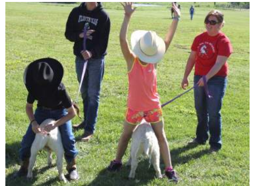
Goat tail tying

"They grow up too fast" is a phrase we as parents say all too often but it's one of truth. Make sure you don't blink too often and cherish every moment! We'll see you next year!