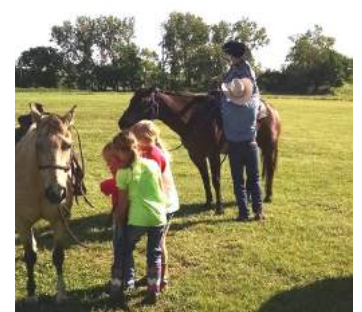
Horse back riding