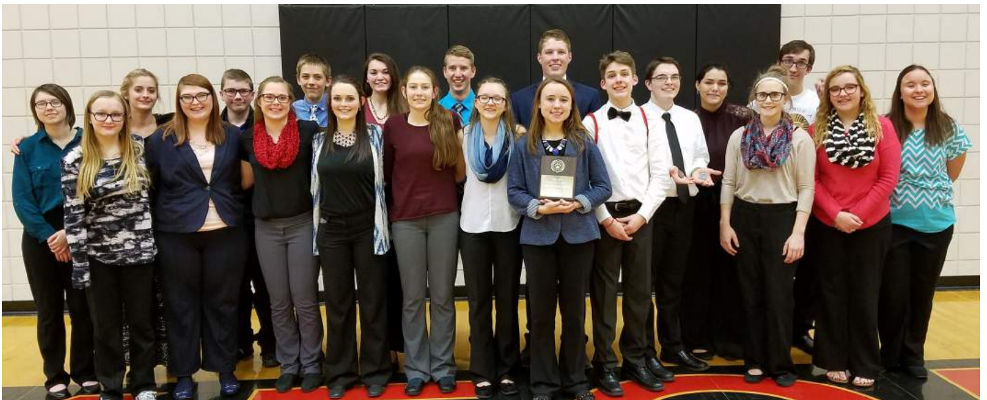
FHS FORENSICS WINS 1ST PLACE!