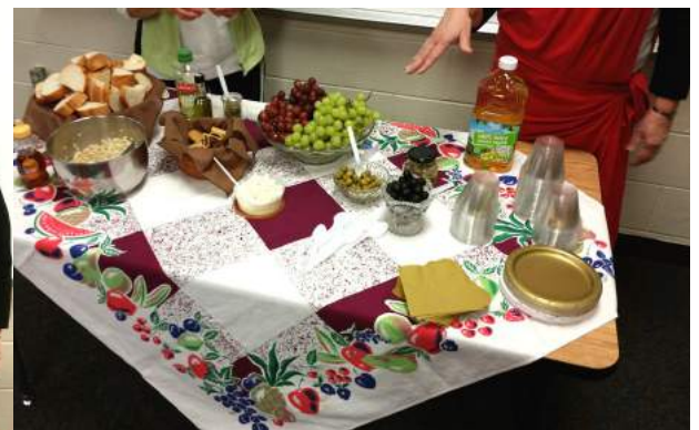
The spread of Greek foods