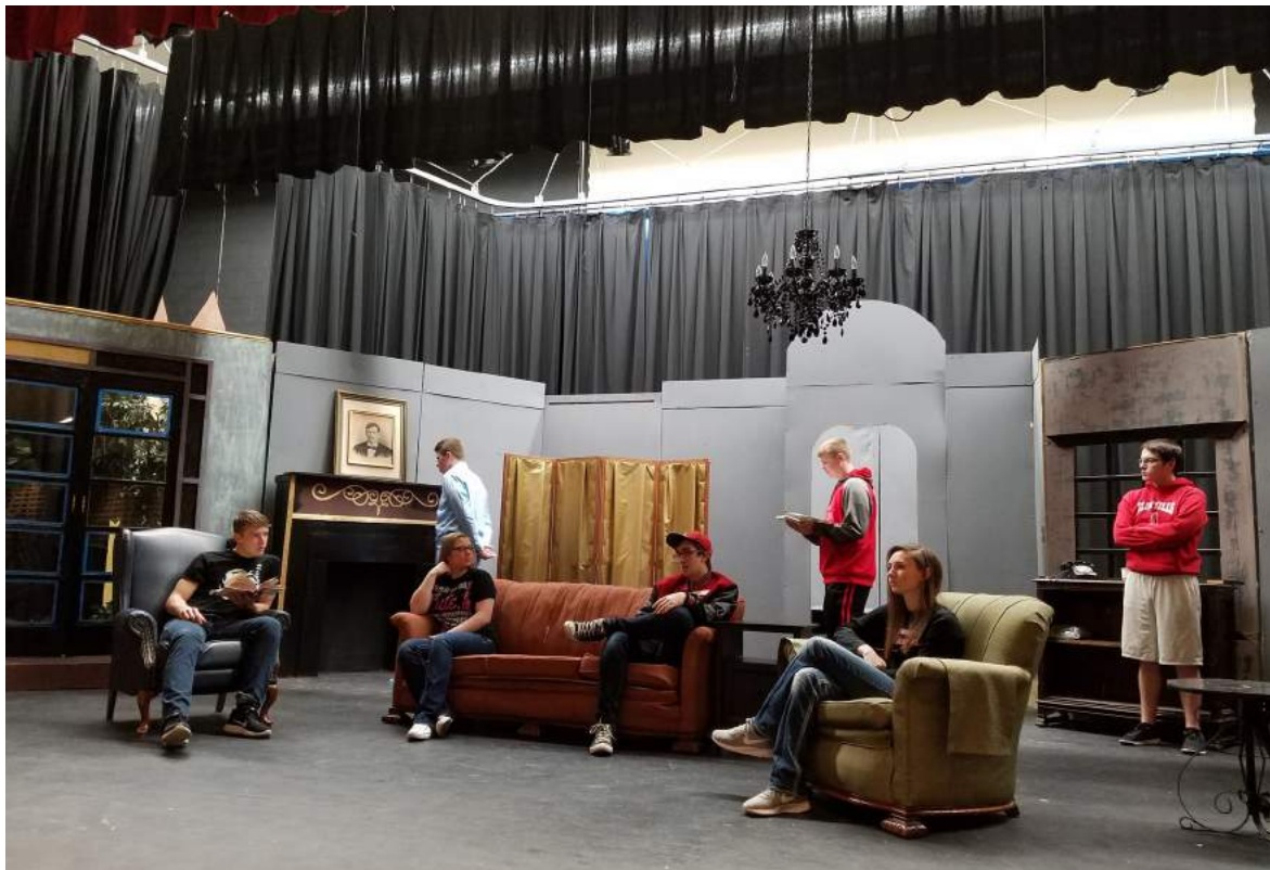
7 OF THE 12 CAST MEMBERS REHEARSE

ATTENTION, ALL FLINTHILLS STUDENTS! PREPARE TO VOTE ON WHICH CHARACTER YOU THINK “COMMITTED THE CRIME!” BALLOTS WILL BE DISTRIBUTED SOON.