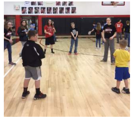
Math relay students playing in the Flinthills gym when they have down-time between their tests.