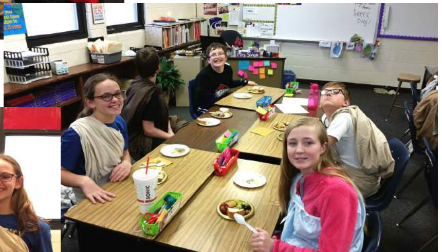
Enjoying their Greek offerings of food.