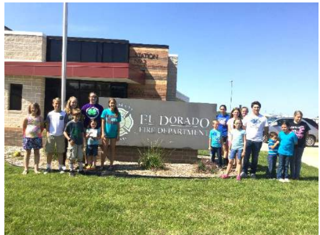
The Cassoday Boosters and the Towanda Rustlers met at Fire Station #2 for an Exchange Meeting.