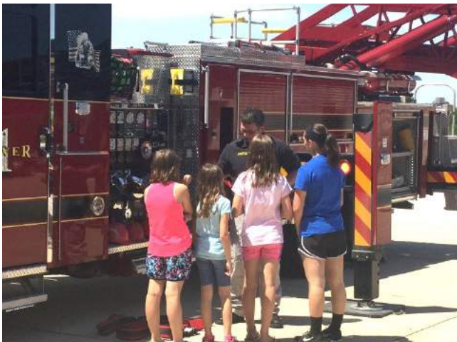
4-H'ers learn about fire trucks.