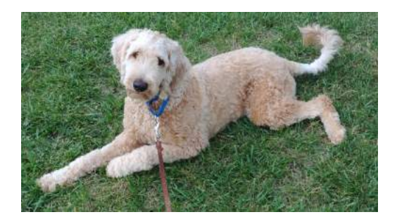
Nelson, our Flinthills Therapy Dog, is growing up!