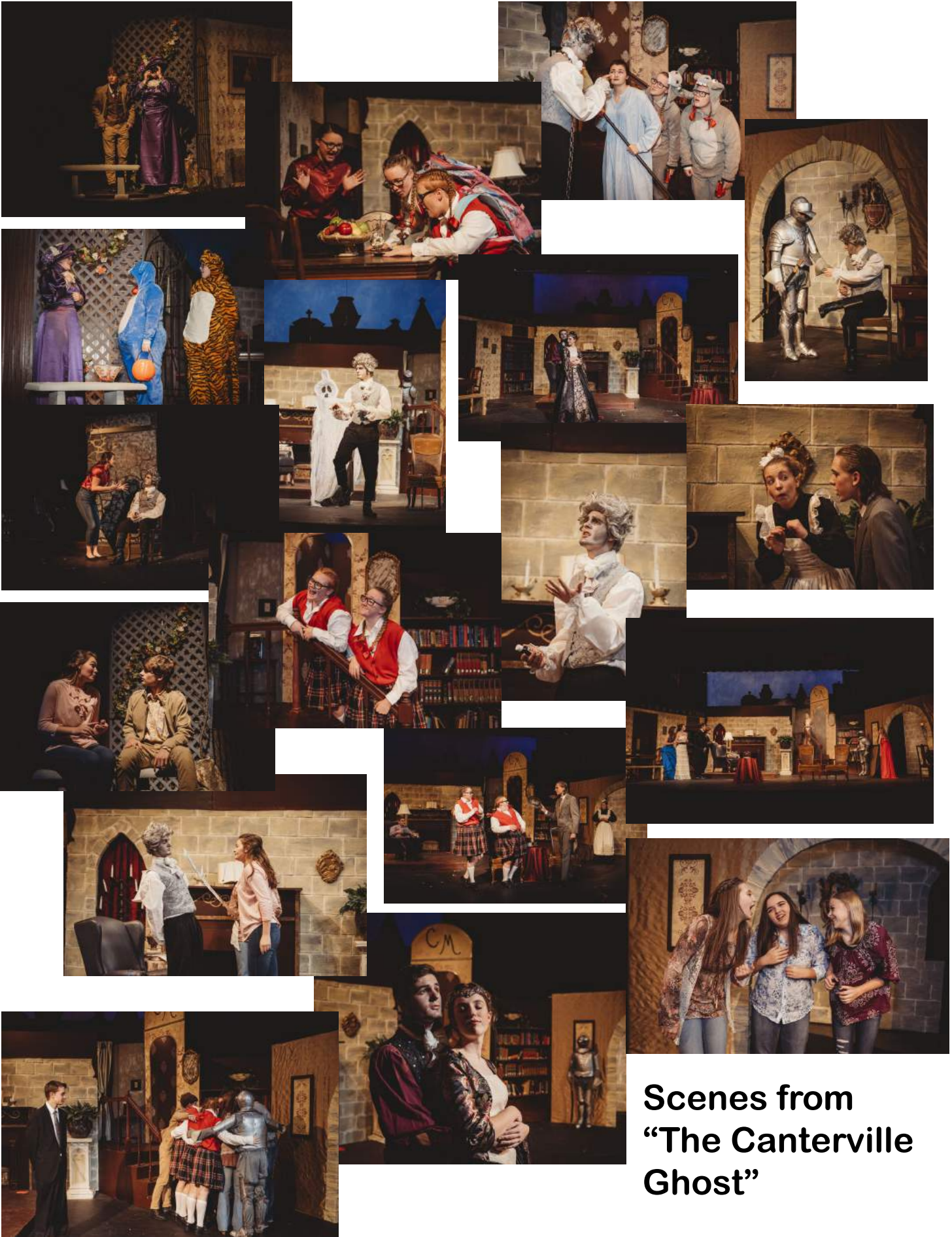
Scenes from "The Canterville Ghost"