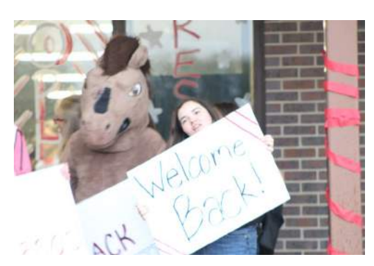
Student Council welcomed students their first day of the school year. Everyone was greeted with a friendly smile and school spirit that morning.