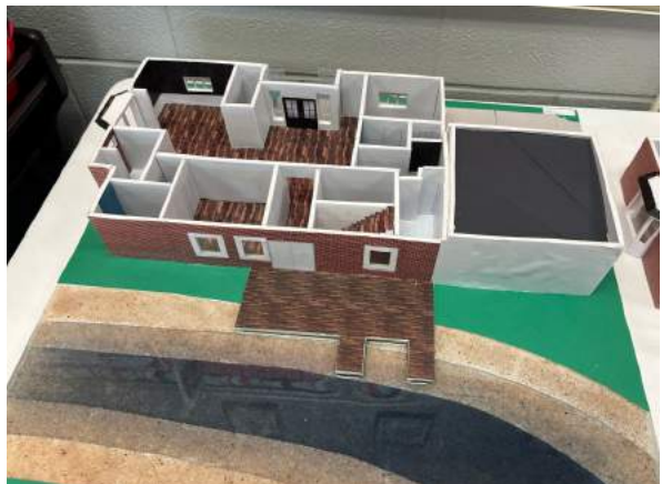
Above: views of the outside of the house