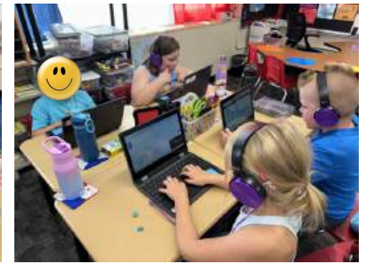
Learning to type with correct hand position.