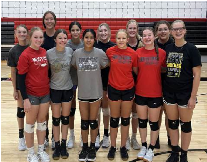
The Lady Mustangs are ready for a great season!

Can't make the game in person? Look for Live Streaming options on the school website! Go to https://www.usd492.org . Find the Quick Links section and click on "SCBL Live Streaming" to access live streaming sites for all league schools.