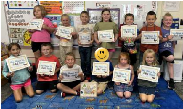
"A My Name is Alice" – Class book about our names.