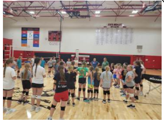
Mustang Summer Volleyball Camp